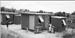
Rotahomes will be built by Saints in their April holiday